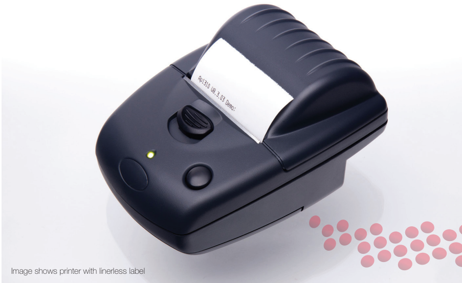
Image shows printer with linerless label

Unique SINGLE-handed easy paper-load system No other printer is easier!